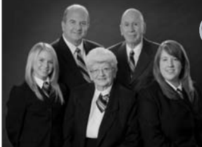
3 Generations of Morgan Family

10008 Lundy's Lane 905.358.5811 www.countrybasketniagara.com